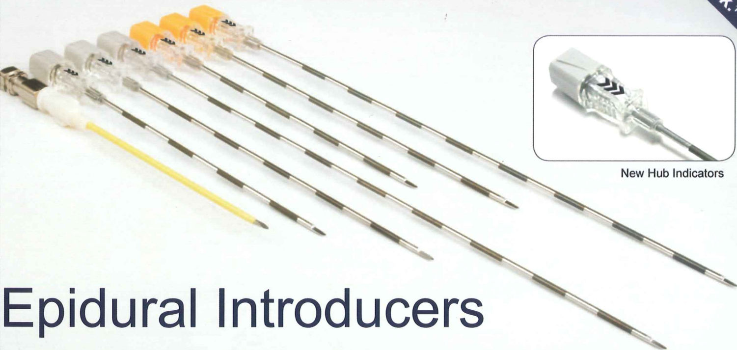
New Hub Indicators